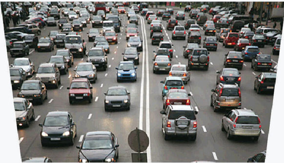
With Up View function

The EIZO Up View function ensures that the colors will not appear washed out if you have to look up at the screen. This is an advantage, for example, if the monitor is mounted on a wall or ceiling.